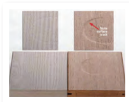
Clubhouse Competitive Cellular PVC Decking