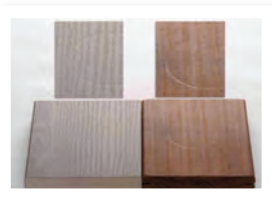
Clubhouse Brazilian Hardwood

Clubhouse Decking rivals the performance of the hardest woods available.